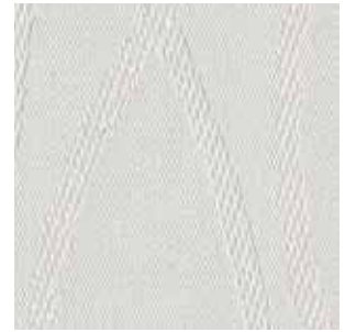
LIMED WHITE HALF