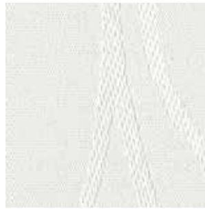
USA ANTIQUE WHITE