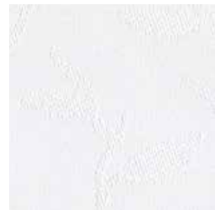
WHITE ON WHITE