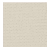
QTR HOG BRISTLE (D)