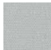
TRANQUIL RETREAT (D)