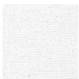
VIVID WHITE (D)