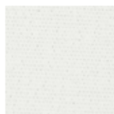
WHISPER WHITE (D)