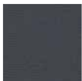
GUILD GREY (D)