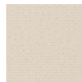
HALF HOG BRISTLE (D)