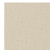
HOG BRISTLE (D)