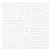
NATURAL WHITE (D)