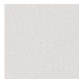
USA ANTIQUE WHITE (D)